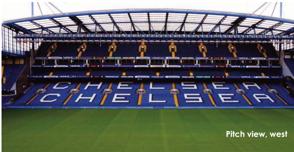
Pitch view, west