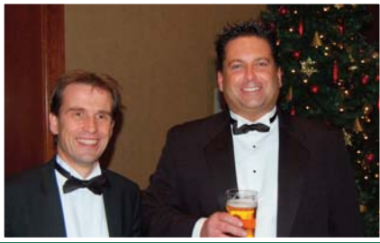
Champagne Reception & Gala Dinner...