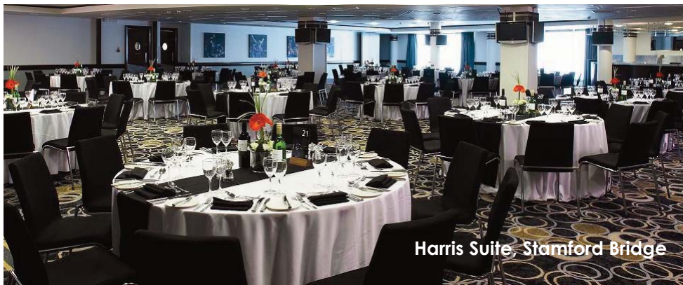
Harris Suite, Stamford Bridge

Each suite offers natural daylight, and some have access to the terraces for a stunning view of the stadium and pitch.